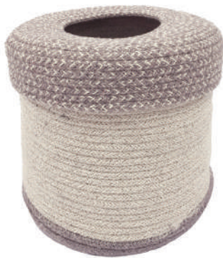
RugCycled® Bin Basket Natural - RugCycled yarn

C-RUC-BER-XS | C-RUC-BER-S | C-RUC-BER-M 90x130 cm | 120x160 cm | 140x200 cm 3' x 4' 3" | 4' x 5' 3" | 4' 7" x 6' 7"