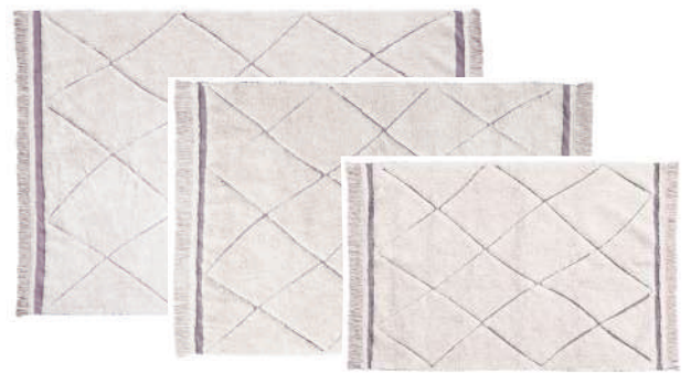
RugCycled® Bereber Washable rug Natural - RugCycled yarn

C-RUC-AZT-XS | C-RUC-AZT-S | C-RUC-AZT-M 90x130 cm | 120x160 cm | 140x200 cm 3' x 4' 3" | 4' x 5' 3" | 4' 7" x 6' 7"