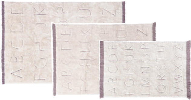
RugCycled® ABC Washable rug Natural - RugCycled yarn

C-RUC-ABC-XS | C-RUC-ABC-S | C-RUC-ABC-M 90x130 cm | 120x160 cm | 140x200 cm 3' x 4' 3" | 4' x 5' 3" | 4' 7" x 6' 7"