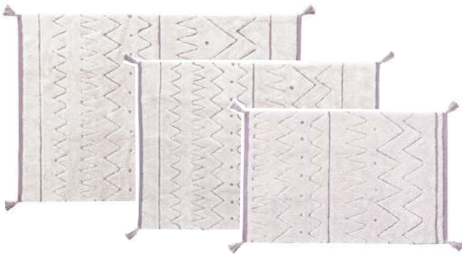
RugCycled® Azteca Washable rug Natural - RugCycled yarn

C-RUC-CLO-XS | C-RUC-CLO-S | C-RUC-CLO-M 90x130 cm | 120x160 cm | 140x200 cm 3' x 4' 3" | 4' x 5' 3" | 4' 7" x 6' 7"