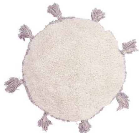
RugCycled® Circle Floor Cushion Natural - RugCycled yarn