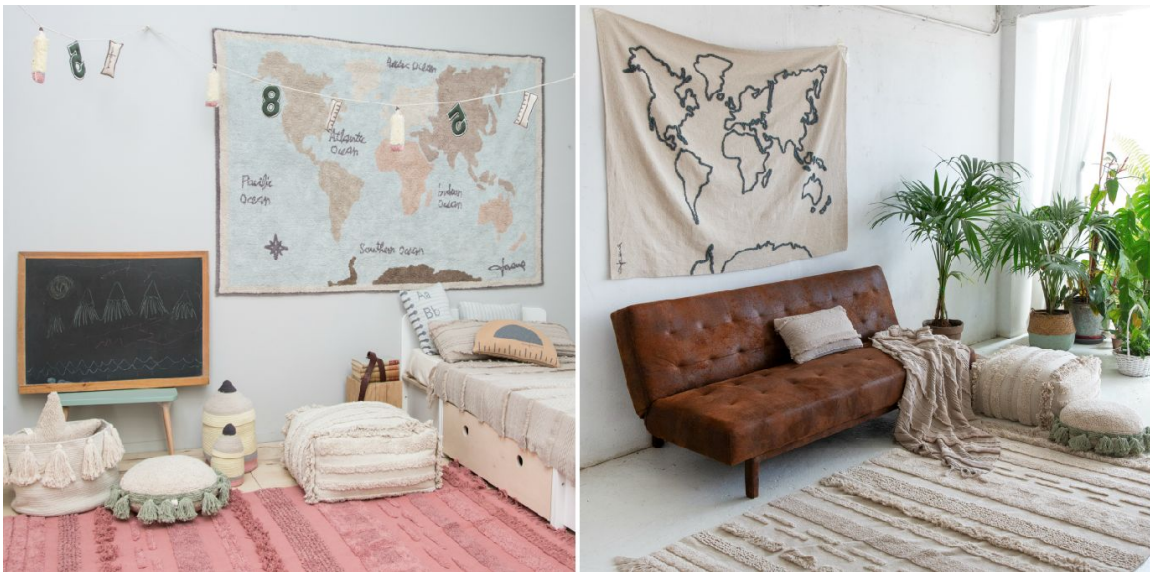
"Vintage Map" washable rug 140x200cm and washable wall hanging "Canvas Map" 120x160cm

Lorena Canals' involvement in the schooling of children in northern India through her Sakûla Project is what drove and inspired her to create this collection.