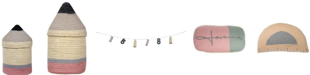
Washable rug 120x160cm, Blanket 90x120cm. and cushion 30x45cm. "Notebook", baskets "Pencil" in two sizes 13x30cm. and 25x45cm. Garland "School" 240x20cm. and cushions "Eraser" 45x24cm. and "Ruler" 30x50cm.