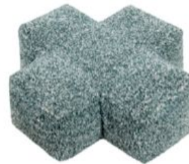
Washable rug "I Love Math" 140x200cm. "Plus" floor cushion 50x50x18cm.