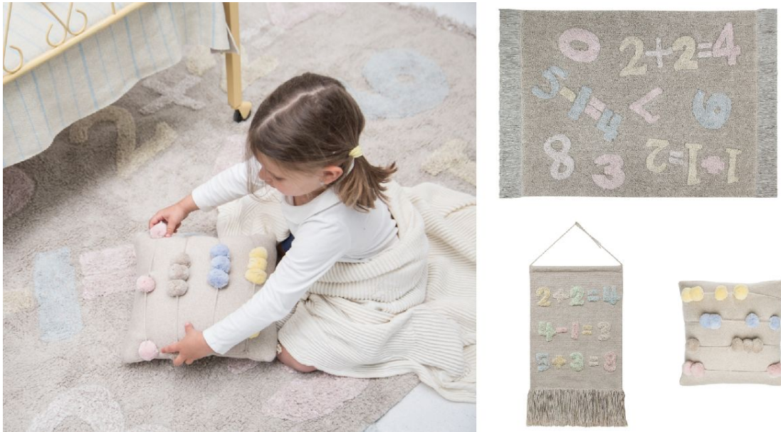
"Baby Numbers" washable rug 120x160cm., wall hanging "Baby Numbers" 30x55cm, and "Counting Frame" cushion 30x30cm

Getting kids to like math is a challenge for most parents. The most babyish designs of the Back to School collection are inspired by the world of numbers and simple mathematical expressions, embossed in different pastel colors of cotton yarn, over a light gray base.