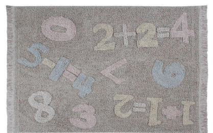
Baby Numbers C-BABYNUM 120 x 160 cm 3500 g