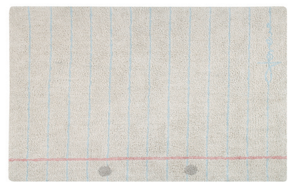
Notebook C-NOTEBOOK 120 x 160 cm 3500 g