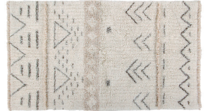
Lakota Day WO-LAKODA-S 140 x 80 cm