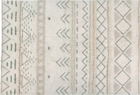
Lakota Day WO-LAKODA-L 170 x 240 cm

We highlight the natural beauty that wool provides with carefully selected colors, adding small details such as fringes knotted by hand, mix of colors and a combination of different heights. As a result the designs have a bohemian touch ready to give your home that special extra you were looking for.