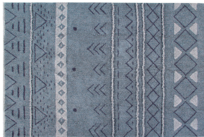
Lakota Night WO-LAKONI-M 140 x 200 cm