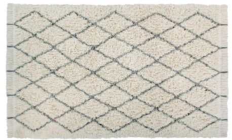
Berber Soul WO-BERB-XL 300 x 200 cm