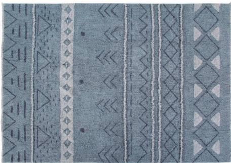
Lakota Night WO-LAKONI-L 170 x 240 cm