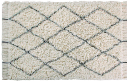
Berber Soul WO-BERB-M 140 x 200 cm