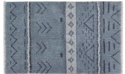
Lakota Night WO-LAKONI-S 140 x 80 cm