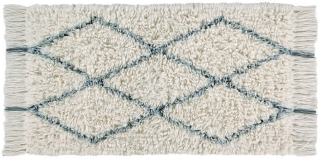
Berber Soul WO-BERB-S 140 x 80 cm