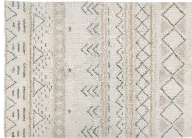
Lakota Day WO-LAKODA-M 140 x 200 cm