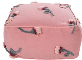
POUFFE Ash Rose P-GARDEN-ASH 54 x 54 x 27 cm 2300 g