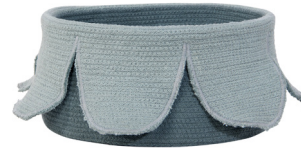
COTTON BASKET Petals Vintage Blue - Dark Green BSK-PETALS-VB 20 x Ø33 cm 900 g