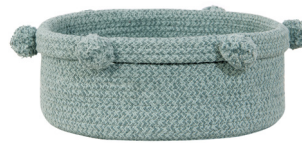
COTTON BASKET Tray Vintage Blue BSK-TRAY-VB 12 x Ø30 cm 500 g