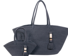
COTTON BASKET Cistell Dark Grey | Dark Grey Small BSK-CIS-DGR | BSK-CIS-DGR-S 18 x 65 x 35 cm | 10 x 33 x 15 cm 900 g | 230 g