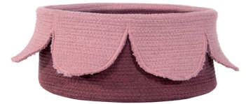
COTTON BASKET Petals Ash Rose - Dark Aubergine BSK-PETALS-ASH 20 x Ø33 cm 900 g