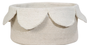
COTTON BASKET Petals Ivory-Natural BSK-PETALS-IVO 20 x Ø33 cm 900 g