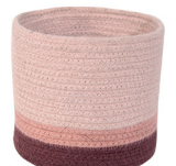
MY LITTLE ONES Mini Tricolor Vintage Nude BSK-TRIC-VNU 15 x Ø15 cm 200 g

Each flower is handmade individually by our expert artisans