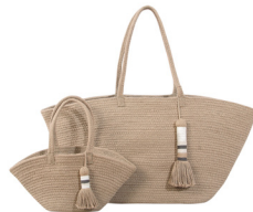
COTTON BASKET Cistell Linen | Linen Small BSK-CIS-LIN | BSK-CIS-LIN-S 18 x 65 x 35 cm | 10 x 33 x 15 cm 900 g | 230 g