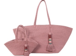
COTTON BASKET Cistell Ash Rose | Ash Rose Small BSK-CIS-ASH | BSK-CIS-ASH-S 18 x 65 x 35 cm | 10 x 33 x 15 cm 900 g | 230 g