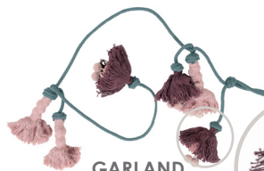
GARLAND English Garden GARL-GARDEN 125 cm 170 g