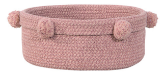
COTTON BASKET Tray Brick Ash Rose BSK-TRAY-ASH 12 x Ø30 cm 500 g