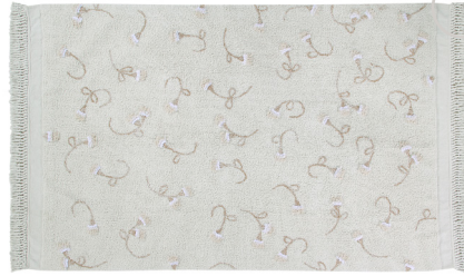
Ivory C-GARDEN-IVO 140 x 210 cm 4200 g