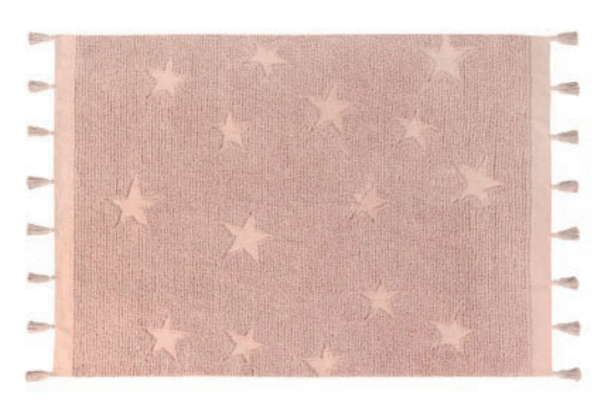
Hippy Stars Vintage Nude 120 x 175 cm | C-HI-ST-VINTNU