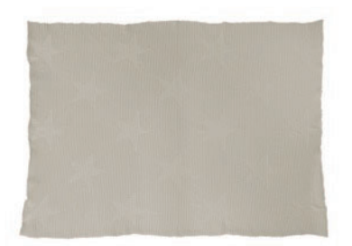
Hippy Stars Natural 90 x 120 cm | BLC-HI-ST-NAT