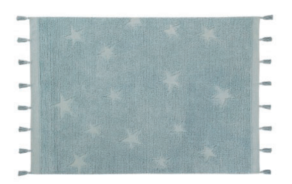
Hippy Stars Aqua Blue 120 x 175 cm | C-HI-ST-AQUA