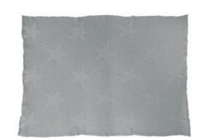
Hippy Stars Pearl Grey 90 x 120 cm | BLC-HI-ST-GREY