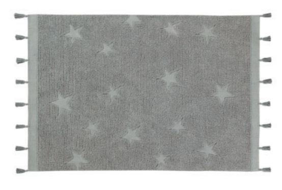
Hippy Stars Grey 120 x 175 cm | C-HI-ST-GREY