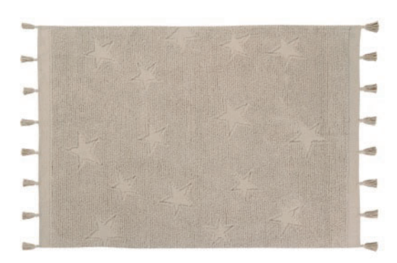
Hippy Stars Natural 120 x 175 cm | C-HI-ST-NAT