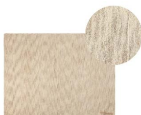
Mix Ritika Sand Beige

Weight: 6 Kg (140 x 200 cm) / 4 Kg (90 x 160 cm)