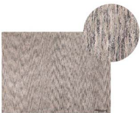
Mix Nancy Linen-Pink

140 x 200 cm | C-MIX-AARTY 90 x 160 cm | C-MIX-S-AARTY