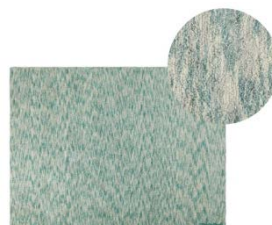
Mix Daksh Emerald Green

140 x 200 cm | C-MIX-RAMLAL 90 x 160 cm | C-MIX-S-RAMLAL