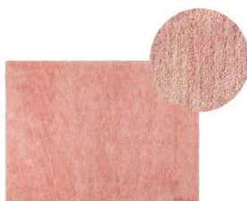
Mix Aarty Flamingo Pink

140 x 200 cm | C-MIX-DAKSH 90 x 160 cm | C-MIX-S-DAKSH