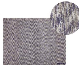
Mix Arian Linen-Navy

140 x 200 cm | C-MIX-NANCY 90 x 160 cm | C-MIX-S-NANCY