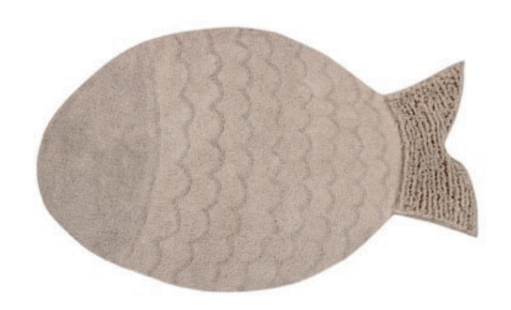
Big Fish 110 x 180 cm | C-BIGFISH