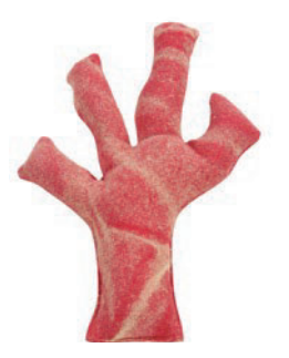
Coral 35 x 55 cm | SC-CORAL