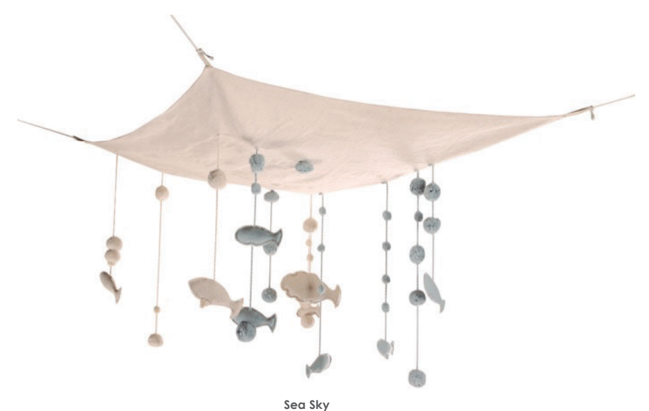
100 x 120 cm | SKY-SEA