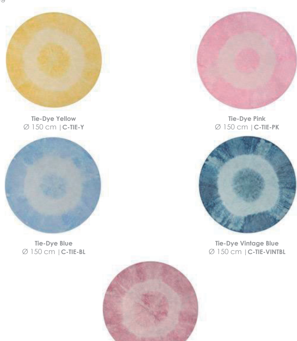
Tie-Dye Vintage Nude Ø 150 cm | C-TIE-VINTNU