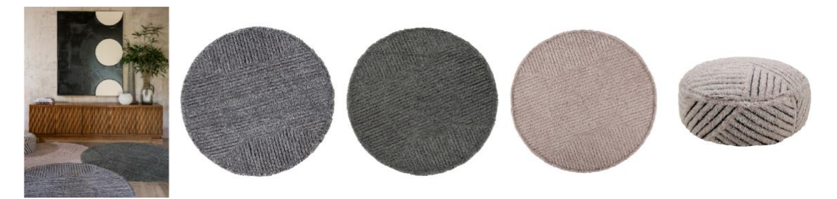
Wool washable rugs Black Tea, Green Tea, and Rose Tea 160x160cm (€, y Pouf Fields 70x70xH20cm.(€) from Woolable by Lorena Canals

The circular models Black Tea, Green Tea, and Rose Tea are inspired by the fertile cultivated lands and its different types of sun-dried tea leaves of rose, black and green tea. These three models of washable wool rugs have been elaborated using the contrast of the cotton canvas base in dark colors visible in between the lines of short pile wool in Misty Rose, Charcoal and a mix of green and grey tones.