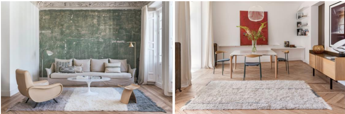
Wool washable rugs Into the Blue 300x200cm (695€) and Autumn Breeze 140x200cm (295€)

Free Your Soul collection goes into a world of sensations and opens the mind and soul pulling out the best of oneself. Lorena Canals has chosen each color to awake unique sensations highlighting the importance each one of them on our wellbeing. Colors transmit to our emotions and awaken the five senses given a special energy to the home.