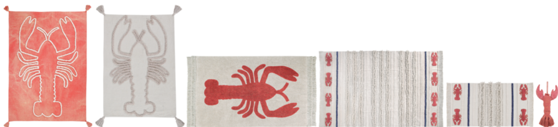
Wall hangings, rugs and door hanger from the Lobster Collection

Joy: As a loyal lobster lover and all things maritime, Lorena Canals launches a fun, marine style collection: the Lobster collection. Having grown up by the sea, Lorena Canals has turned her childhood memories into fun carpets and wall hangings, with matching baskets and door hangers, in intense red and natural tones with textures that seem sprinkled by the wind and sea water and softened by the white sand.