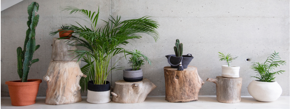
Basket collection by Lorena Canals

Lorena Canals' award-winning designs have garnered international attention for being modern & stylish, yet practical & safe for children. Our fair-trade products are handmade by expert craftsman in India, who use raw materials of the best quality. Our rigorous artisanal process produces environmentally friendly, machine washable rugs and decorative accessories made from natural cotton. All designs are hand stitched and dyed with natural, non-toxic dyes, to ensure durability after washing.