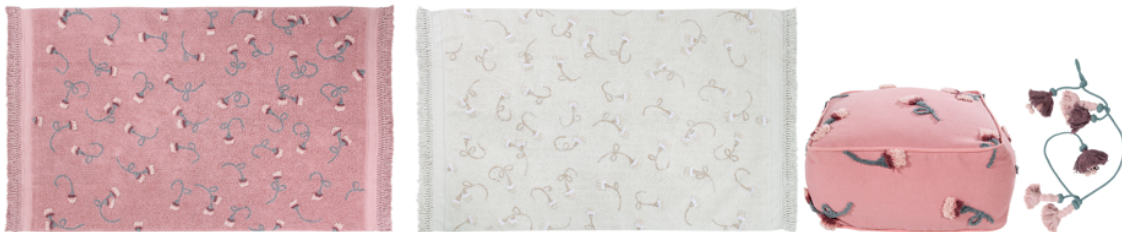
Rugs, puff & garland from the English Gardens collection

Elegance: The English Gardens collection is inspired by the richness of colors and textures experienced in English botanical gardens, which captivated the designer as a child. Nature teaches us the importance of small details, and this point is highlighted by the elaborate finishes in this collection and the introduction of a new type of handmade knotted fringe. This collection has the largest number of accessories, comprising of baskets, a puff and garlands in pink, mauve and white with renewed and elegant floral designs.