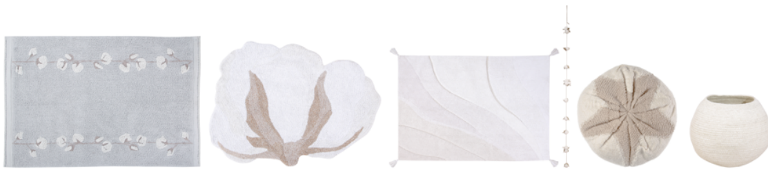
Rugs, cushion and basket from the Tribute to Cotton collection

Elegance: The English Gardens collection is inspired by the richness of colors and textures experienced in English botanical gardens, which captivated the designer as a child. Nature teaches us the importance of small details, and this point is highlighted by the elaborate finishes in this collection and the introduction of a new type of handmade knotted fringe. This collection has the largest number of accessories, comprising of baskets, a puff and garlands in pink, mauve and white with renewed and elegant floral designs.