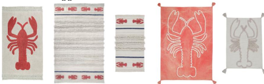
Washable Rug Lobster 140x200cm. (245€.), Mini Lobster 170x240cm (265€.), Mini Lobster XS 80x140cm (79€.), Giant Lobster Brick Red 200x140cm. (155€.) and Lobster Natural 100x70cm. (39€)

New processing techniques. For this stone washed finish of the wall hanging Giant Lobster it has been used a technique that makes unique pieces. Besides, the finish and the tones do not repeat themselves. Furthermore, the Mini Lobster carpet model, available in 2 sizes, get different textures and thickness thanks to the use of various sewing techniques on the canvas basis. In this way, in addition to an original and attractive texture, it is possible to lighten the piece and it allows to offer bigger sizes.