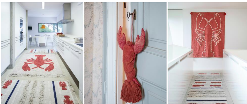
Washable Rug Lobster 140x200cm. (245€.), Mini Lobster XS 80x140cm (79€.), Mini Lobster 170x240cm (265€.), Door Hanger Lobster 50x30cm. (25€.) and Giant Lobster Brick Red 200x140cm. (155€.)

April 2019.- Lorena Canals introduce the new Lobster Collection, in which the designer reflects her passion for the sea, and specially for lobsters. Turning this animal and the living coral, color of the year, into the main character of rugs, carpets and washable baskets full of energy and vitality.