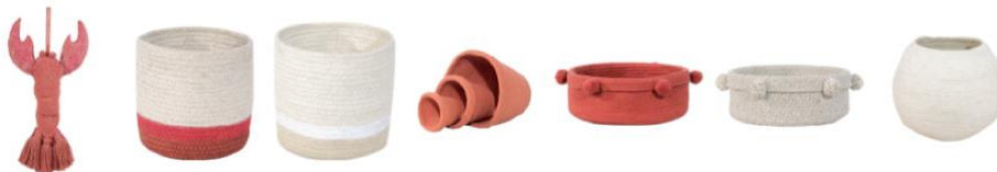
Door Hanger Door Lobster 50x30cm. (25€.), baskets Mini Tricolor Natural and Ivory 15x15x15cm. (15€), Pot Baskets Terracota – Pack 3 sizes 30x30cm, 20x20cm and 13x12cm (59€), Basket tray Brick Red and natural 12x30x30cm (34€.) and Basket Bola Ivory 30x30cm (34€).