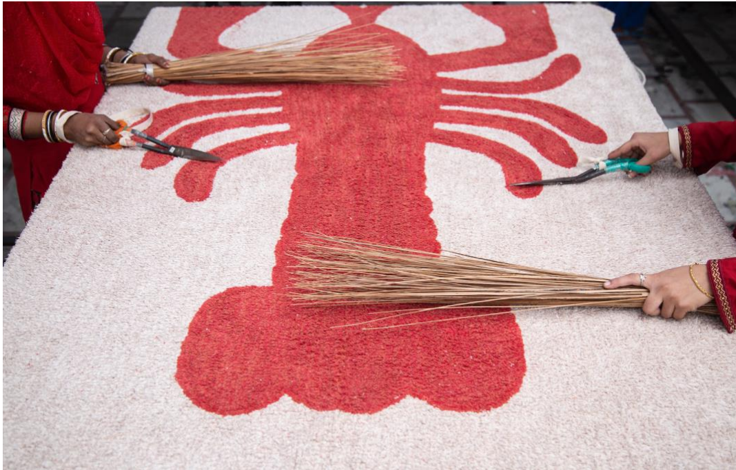
Elaboration of de washable rug Lobster 140x200cm. (245€.)

For Lorena Canals, the follow-up of all the process of the rugs creation in India is very important. The designer works closely with her team of artisans to ensure a fair and safe work environment, which, moreover, they manage to make each piece special and unique.