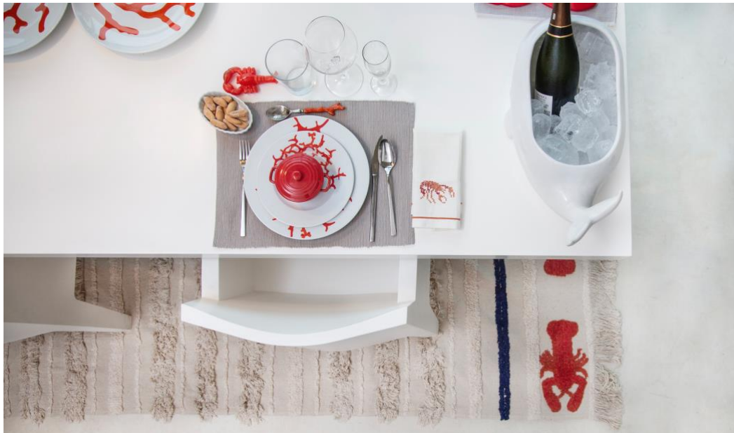
Washable rug Mini Lobster 170x240cm (265€.)

The intense reddish tones of the living coral in the lobsters stand out on the bases in natural colors, inspired by the fine white sand of the paradisiacal beaches. A fresh, young color and with energy that applied to the home makes us live an eternal summer. The blue of the sea takes the form of thin stripes in navy blue that give the collection a marine and fresh touch. The entire collection is carefully crafted by hand, one by one, by the expert artisans in India, using natural cotton and non-toxic dyes.