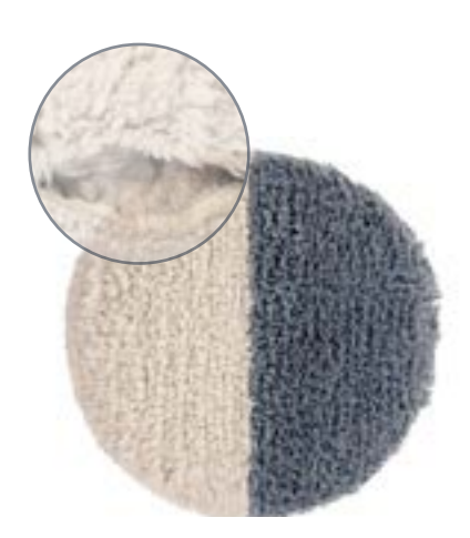
WOOLABLE FLOOR CUSHION SUN RAYS WO-P-SUN Ø 70 X 20 cm - Ø 2' 4"

The Sun Rays pouffe with its reversible design allows you to play and decor any corner of your home. To make it easy to go into the washing machine, the pouffe has a zipper and removable inside filler with polystyrene balls. Sun Rays pouffe combines the contrast colors of Sea Shell, Sandstone and Smoke Blue in medium pile on one side, and short pile on the other.