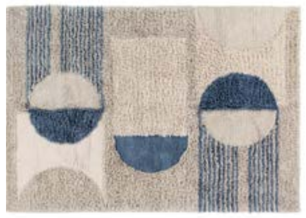
WOOLABLE SUN RAYS RUG WO-SUNRAY-L 170 x 240 cm - 5' 7" x 7' 11"

Sun Rays main inspiration comes from the abstract painting of Regina Giménez. A piece of art created out of a pre-existing chart of an old almanack representing the solstice and the equinox. The simple shape's colors symbolize the light that reflects and influences the Earth. It portrays the brightness and the shadow of the Earth transformed into art.