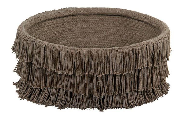
Basket Pío Pío Nest - Ø40 x 20 cm

A bowl-shaped basket adorned on the outside with tousled fringes of different lengths, whose inspiration –as one can guess– comes from a bird's nest hidden at the tree tops.