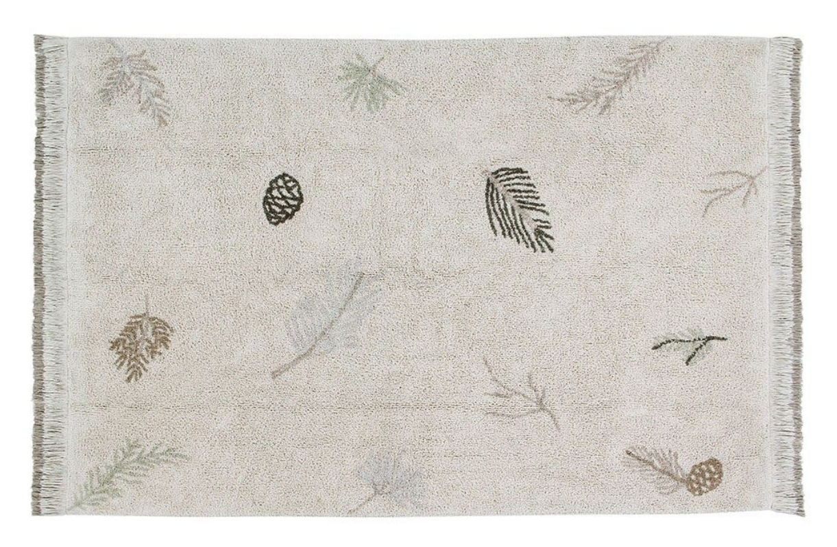
Pine Forest Washable Rug - 140 x 200 cm

On childhood forest walks, who hasn't collected little treasures, such as tiny twigs, leaves, herbs, or pinecones? The essence of the woods and its energy reaches us through the senses when experiencing the rugged texture of dry leaves, the smell of resin, the birds singing or the taste of wild berries. The Pine Forest rug is a reflection of those precious childhood moments collecting items in the woods; of those aromas and sounds that imbue us with their essence, in a stage of full discovery and connection with nature .