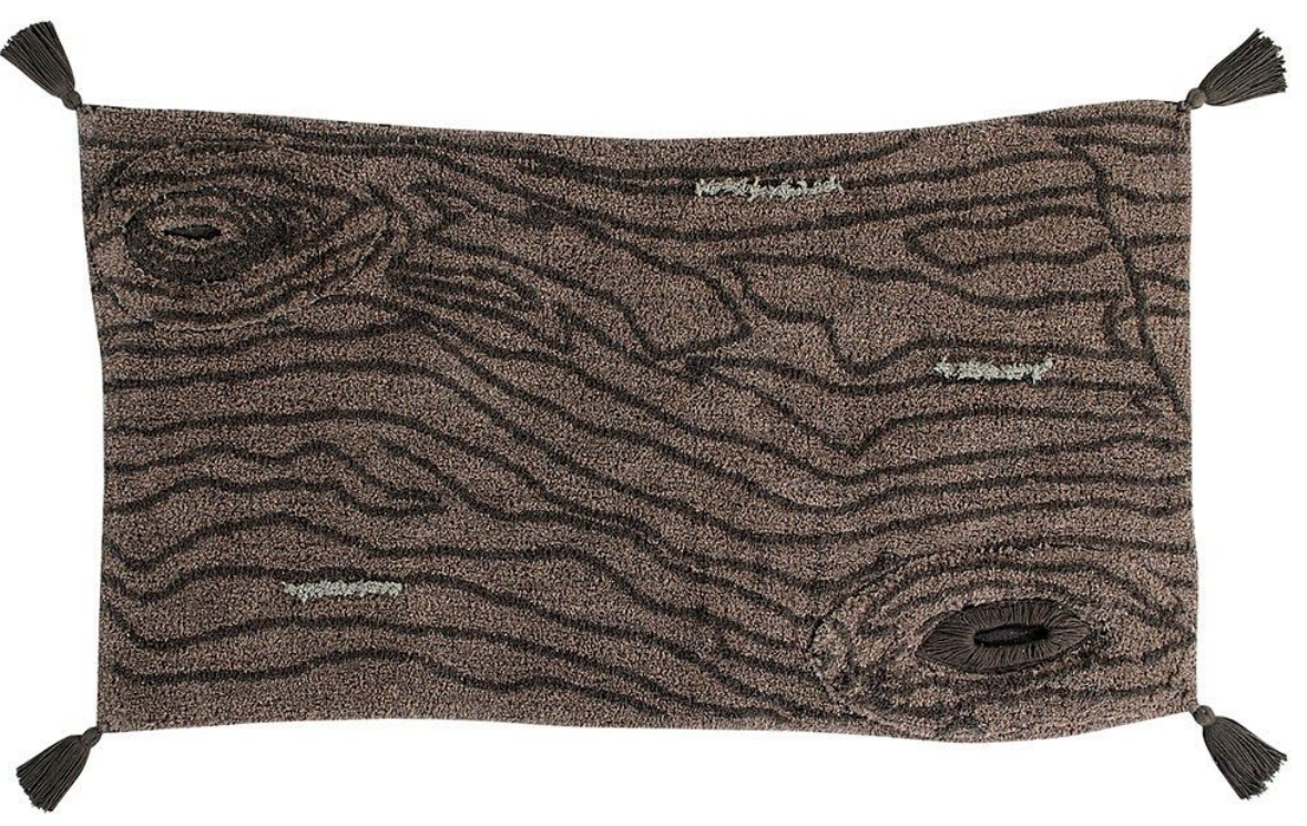
Washable rug Pine Tree - 80 x 140 cm

The adventure continues with a Pine Tree – or rather, its bark made into a rug! A warm piece that evokes the Mediterranean pine and seems to exude a life of its own, awakening the imagination of the little ones with its delicate finishes and three-dimensional effects.