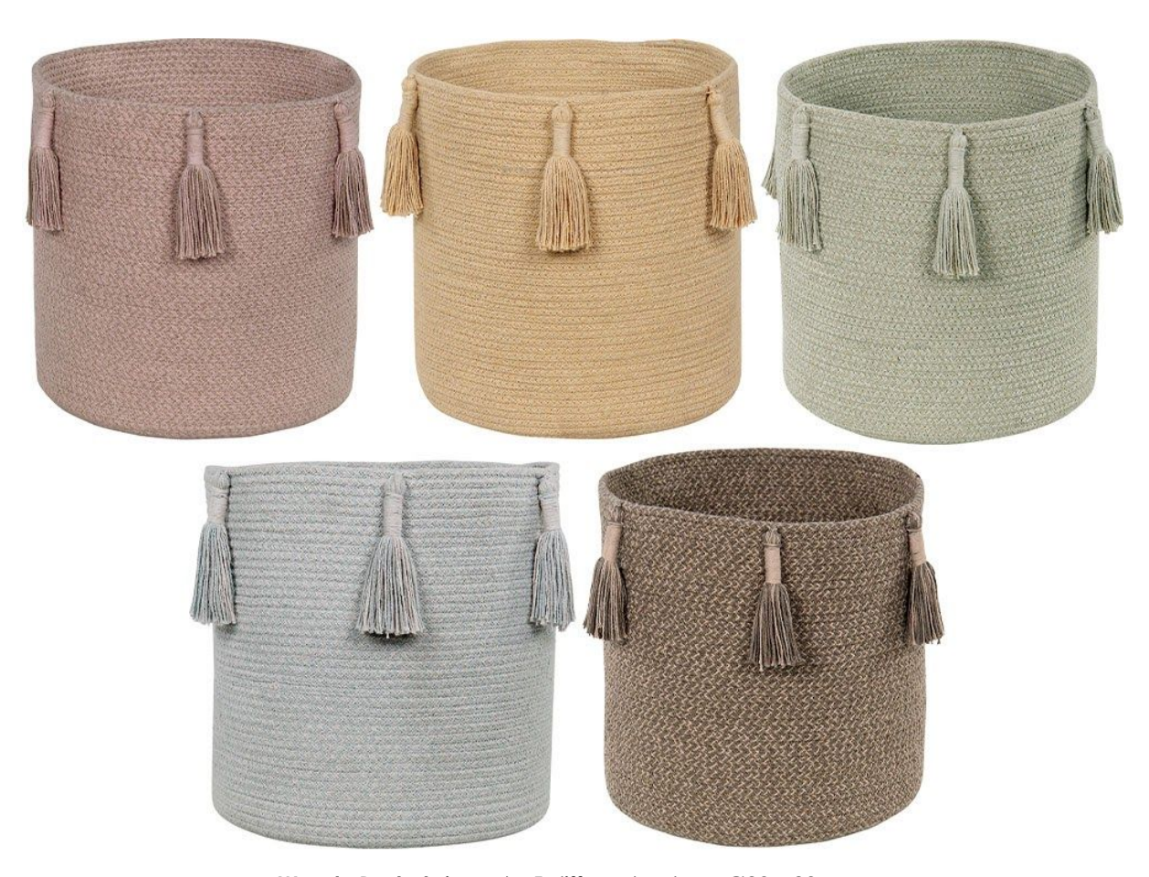
Woody Baskets in up to 5 different colors - Ø30 x 30 cm

The Woody basket is handmade with braided cotton cords of mixed yarn colors , always combining two shades to achieve an ever-changing color palette that is inspired by nature. Finished with handcrafted , mixed-color tassels attached around the edges, and come in up to five different color combinations : dark & light Olive, Vintage Nude & Linen, Pearl Grey & Aqua blue, light & dark Honey, and Soil brown & Linen.