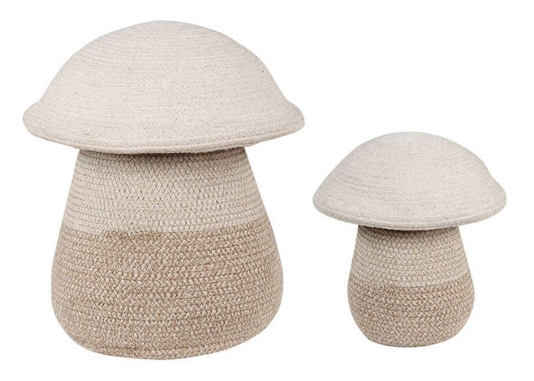
Basket Mama Mushroom - Ø33 x 38 cm | Basket Baby Mushroom - Ø23 x 27 cm

A crisp, sunny autumn morning is the perfect time to explore the woods in search for mushrooms! Almost like toys in themselves, the Mama Mushroom and Baby Mushroom baskets can be used either together or separate, each of them as a safe storage place for children's little treasures. Two baskets in one, as the lid can also function separately as a second bowl-shaped basket where the little ones can put small items and play, keeping things tidy.