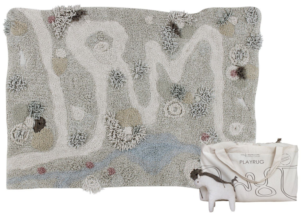
Washable Play Rug Path of Nature - 120 x 160 cm

The starting point is the iconic Path of Nature design – a play rug made for kids to experiment and make up their own stories of innumerable adventures in the woods, with a small cotton stuffed horse as the protagonist. It mimics the textures of the forest's plants creating a miniature landscape . Like a walk in nature where the imagination flows!