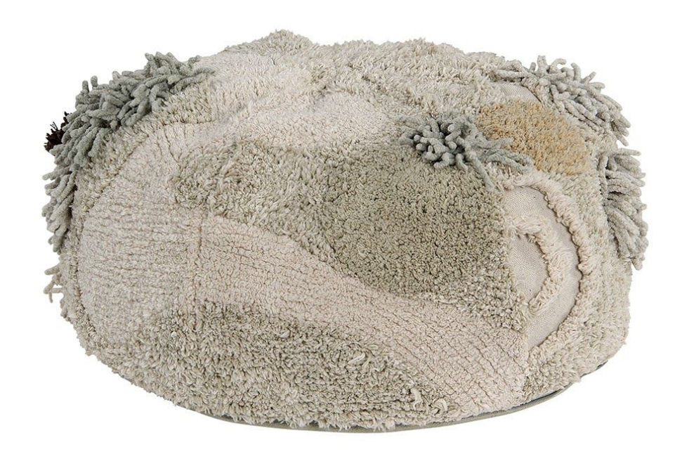
Mossy Rock Pouffe - Ø50 x 30 cm

Just like a rock in the middle of the woods that is covered in lichen and moss, with a rounded shape that invites you to take a seat and rest from your walk. The Mossy Rock pouffe is like the favorite place to set up a picnic, only now its inside the home! And with no need to worry, because it has a removable , machine-washable cover! The same soft-colored yarn mixes as in our Path of Nature play rug is used, including similar details that resemble patches of lichen and moss found on rocks in the woods.