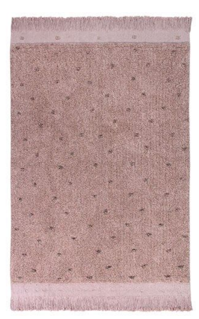
Washable rugs Woods Symphony - 140 x 200 cm