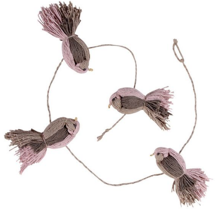
Pío Pío Garland (100 cm)