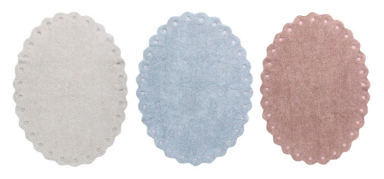
Washable rugs Pine Cone - 130 x 180 cm

The Pine Cone rug owes its inspiration to the changes in shades that this seed-bearing fruit experiences throughout its life cycle and across the seasons – green when young, brown when mature, rosy in summer or ivory in winter. A pearl blue shade was added to this palette, simply because it looked great on the rug! Available in three colors taken from this seasonal palette, it is handcrafted using mixed cotton yarn that blend linen with ivory ( Linen Ivory ), sky blue with pearl gray ( Pearl Blue ), and dusty pink with linen ( Vintage Nude ).