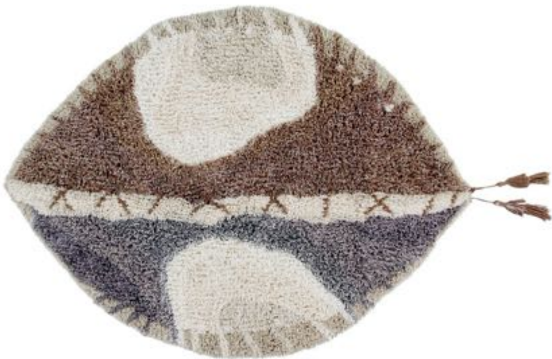
WOOLABLE Washable rug Kinga - 140x200 cm

A simple way of life, in harmony with the surrounding wildlife is the philosophy that our Enkang rug intends to convey. Its design plays with contrasted short and medium pile heights, creating a subtle pattern that mimics the acacia wood fencing . The rug has a slightly irregular contour, and each of its four corners displays a handcrafted braid . Three of these symbolize the roots of a tree, and one has contrasted details in Arabesque color – a hint to the red-clad Maasai shepherds commonly spotted amidst the wilderness. The braids can be removed easily to avoid them getting damaged when washing the rug.