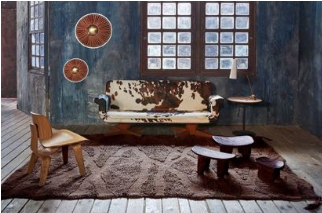
WOOLABLE Washable rug Enkang Brown - 170x240 cm, 200x300 cm, 70x200 cm