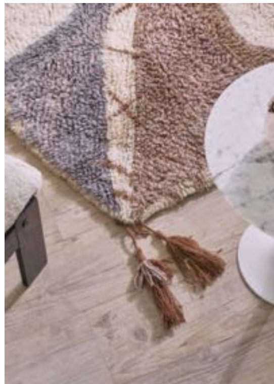
Left: WOOLABLE Washable rug Naranguru (170 x 240 cm) Right: WOOLABLE Washable rug Kinga (140 x 200 cm)