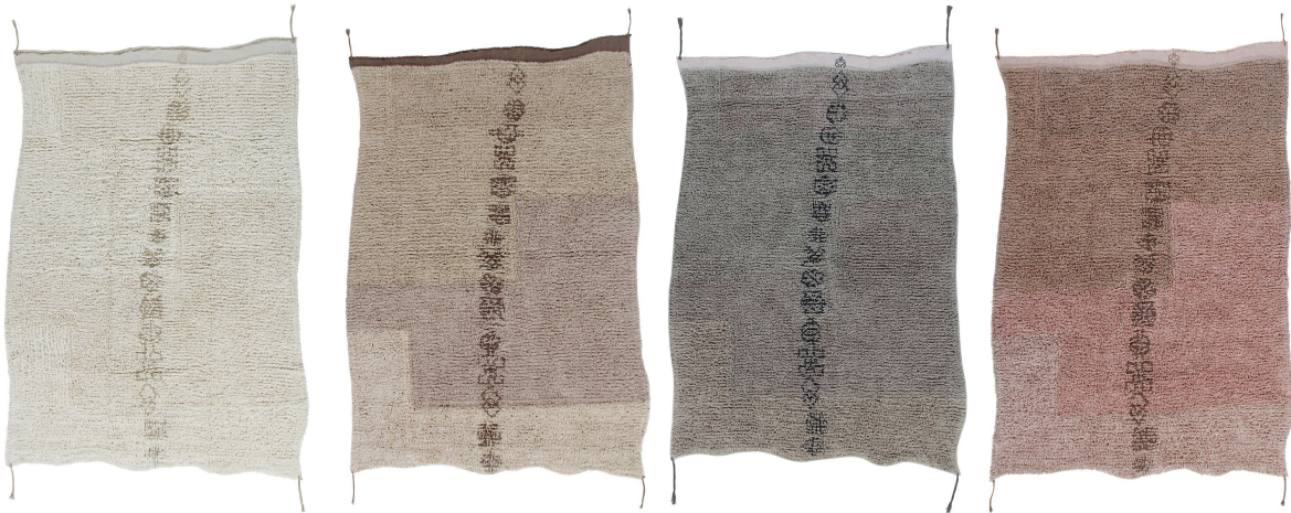
WOOLABLE Washable rugs Symbols : Jambo, Amani, Maisha, Upendo. Available in two sizes: 140x200 cm | 170x240 cm