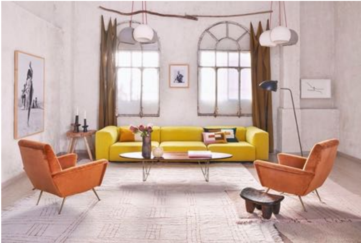
WOOLABLE Washable Rugs Shuka (front) and Bahari (far end), from the Africa Collection

The Africa collection comprises 8 different designs that vary in colors and sizes to make up a total of 28 new references in the Woolable by Lorena Canals® catalog . The colors used are all inspired by the hues found in the East African landscape and elements of the tribal culture , with a palette including different shades of brown from acacia wood; terracotta or oxide hues from clay or the amazing sunsets; ivory white from Cowrie seashells and Zanzibar's white sandy beaches; yellow and dusty pink from African print fabrics; Linen color or beige, from the cracked Serengeti dry mud; and, of course, the unmistakable vibrant red that is essential to the Maasai tribes.