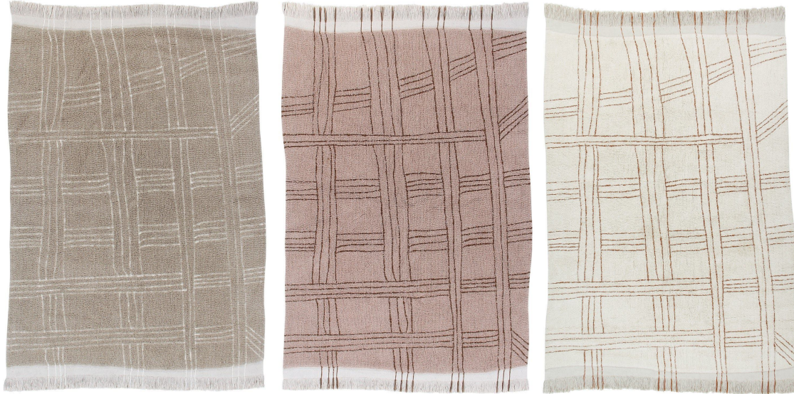
WOOLABLE Washable rug Shuka - Sandstone, Dusty Pink and Seashell. Available in two sizes: 170x240 cm | 200x300 cm