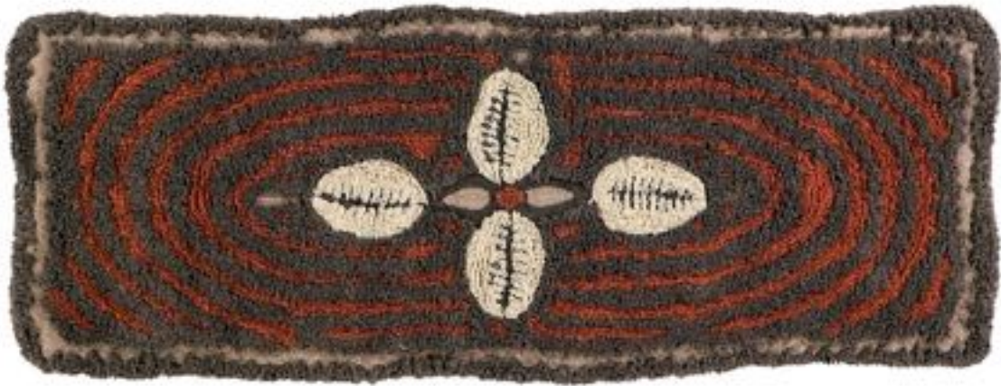
WOOLABLE Washable rug Cowrie Bracelet - 90x240 cm

8 different designs that vary in color and size to make up a total of 28 new references in the Woolable by Lorena Canals® catalog.