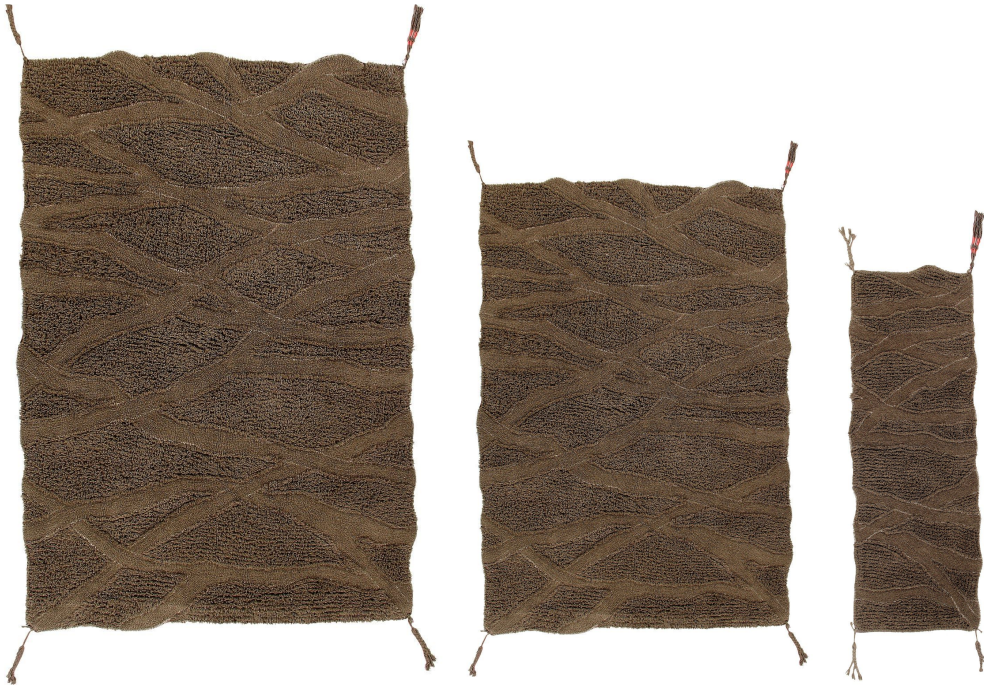
WOOLABLE Washable rug Enkang Brown . Available in 3 sizes: 70x200 cm | 170x240 cm | 200x300 cm