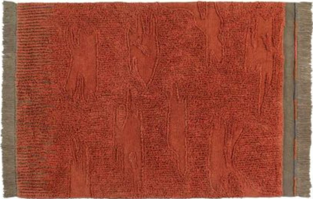
WOOLABLE Washable rug Naranguru - 170x240 cm