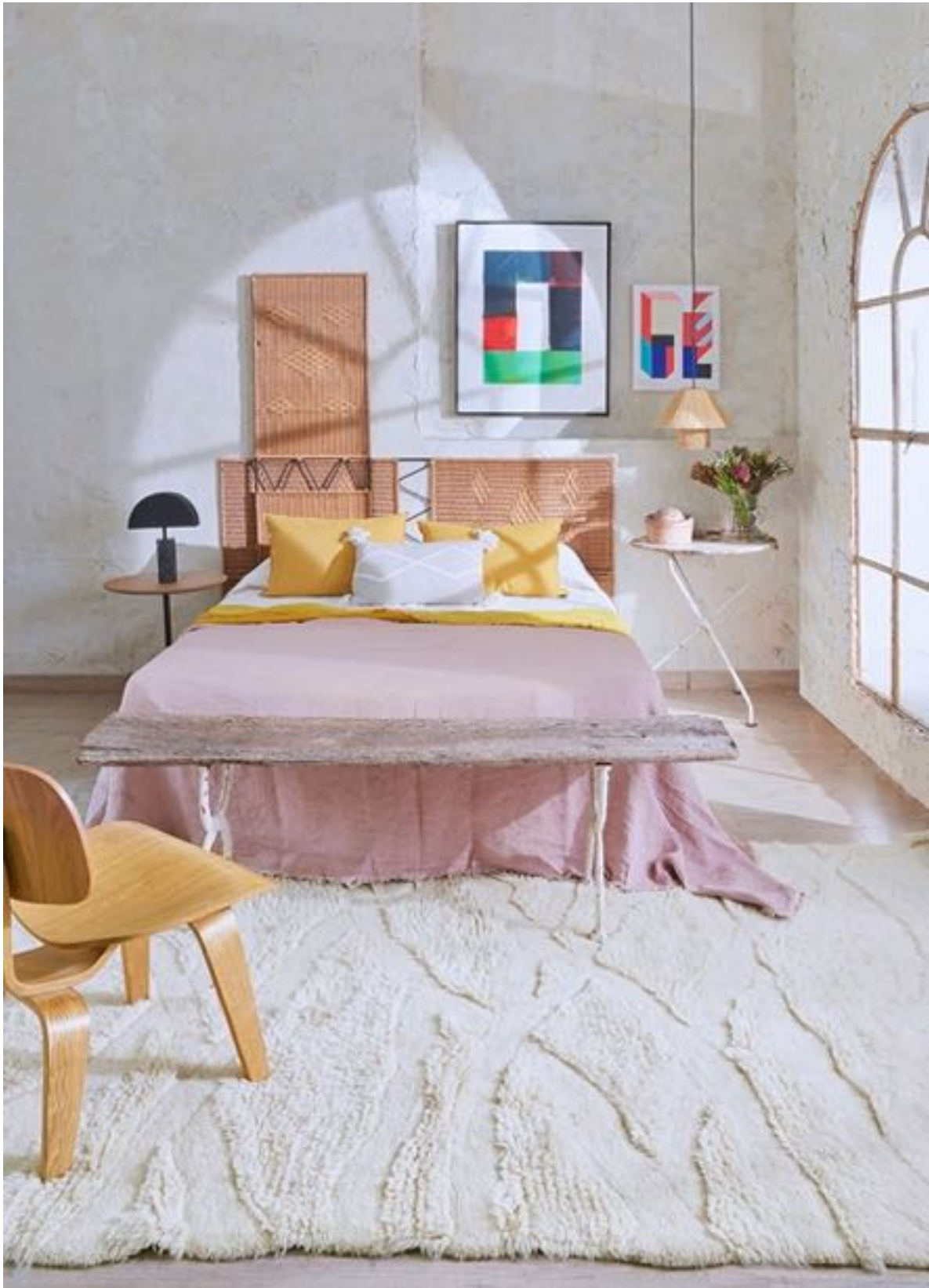
WOOLABLE Washable rug Enkang Ivory - 170x240 cm, 200x300 cm, 70x200 cm