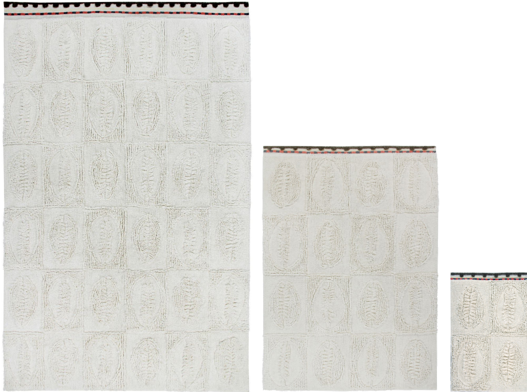
WOOLABLE Washable rug Bahari . Available in three sizes: 80x120 cm | 170x240 cm | 200x300 cm