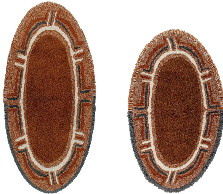
WOOLABLE Washable rug Karibu - Available in two sizes: 80x140 cm | 110x200 cm