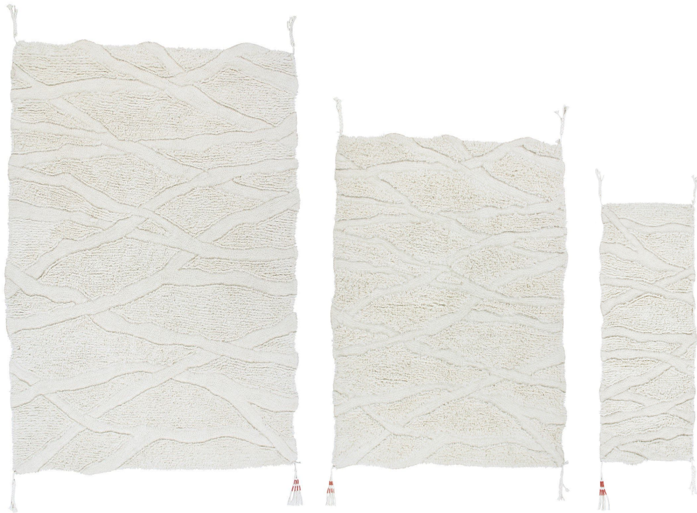
WOOLABLE Washable rug Enkang Ivory . Available in 3 sizes: 70x200 cm | 170x240 cm | 200x300 cm

way of life, they even take the wooden poles with them when settling in a new area. Something as simple as these acacia branches used for fences, or even the sticks that the Maasai use, from a very young age, as a defense weapon against wild animals when venturing outside their villages –doubling up as a resting support to avoid lying on the ground–, are what inspired the concept of simplicity behind this rug's design.