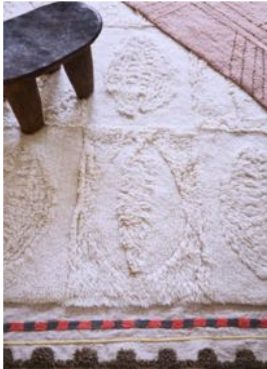
Left: WOOLABLE Washable rug Enkang Brown - 170x240 cm, 200x300 cm, 200x70 cm Right: WOOLABLE Washable Rug Bahari - 80x120 cm, 170x240 cm, 200x300 cm