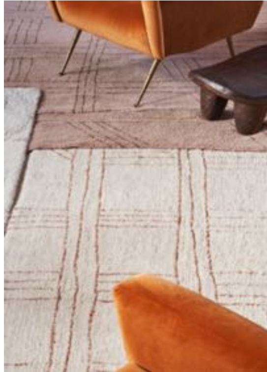
Left: on the wall, WOOLABLE Washable rug Karibu - 80x140 cm, 110x200 cm; below, WOOLABLE Washable rug Naranguru - 170x240 cm | Right: WOOLABLE Washable rug Shuka Sandstone and Shuka Seashell - 170x240 cm, 200x300 cm

The Maasai Mara are one of the most emblematic tribes in Eastern Africa, well known to visitors, as they are the only ones allowed to live within the National Reserves. The Maasai people have co-lived for centuries surrounded by wild animals, surviving as their neighbors thanks to the mutual respect between humans and wildlife.