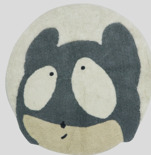
Woolable rug Astromouse WO-E-ASTRO Ø 3' 3"