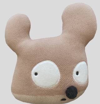
Knitted cushion Miss Mighty Mouse SC-E-HEROG 1' 2" x 1' 2"