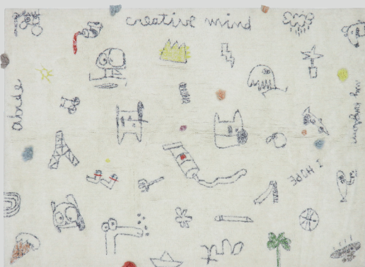
Woolable rug Wall Notes WO-E-WALL 5' 7" x 7' 10"