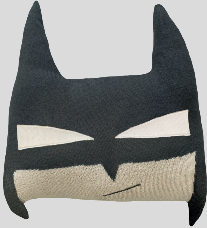
Knitted cushion Batboy SC-E-BATBOY 1' x 1' 2"

Complete the look with the matching knitted cushion!