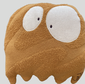
Knitted cushion Ghost SC-E-GHOST 1' x 1'