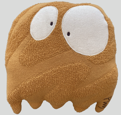
Knitted cushion Ghosty SC-E-GHOST 1' x 1'

Complete the look with the matching knitted cushion!