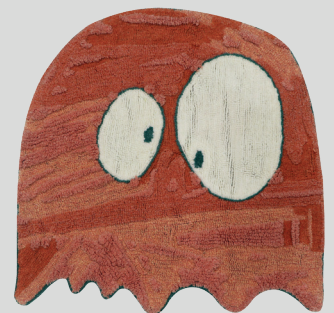
Woolable rug Ghosty WO-E-GHOST 3' 3" x 3' 3"