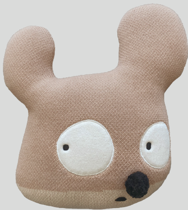
Knitted cushion Miss Mighty Mouse SC-E-HEROG 1' 2" x 1' 2"

Complete the look with the matching knitted cushion!