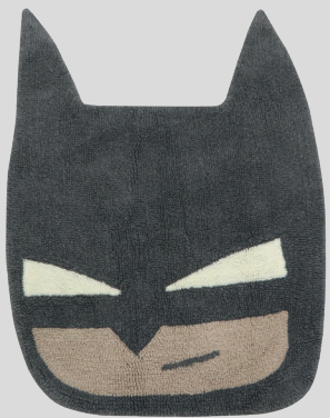
Woolable rug Batboy WO-E-BATBOY 3' x 4"

The pieces in the shape of characters are ideal to decorate the coolest children's rooms with an arty twist , while the rectangular rug can fit both in home environments and in teenager spaces. All carpet designs are hand tufted in natural wool, tinted with non toxic dyes, on a flexible cotton canvas and are machine washable – textile decoration, art and practicality, all in one!