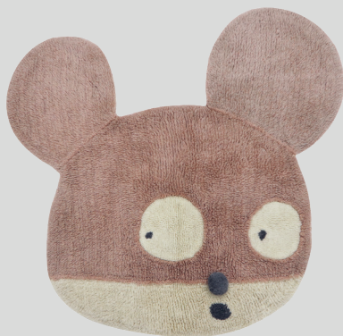
Woolable rug Miss Mighty Mouse WO-E-MOUSE 4' x 4"